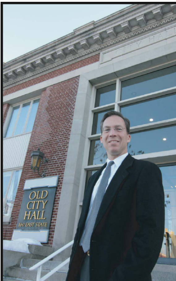
Downtown Traverse City

PRSRT STD U.S. Postage PAID Traverse City, MI Permit No. 343