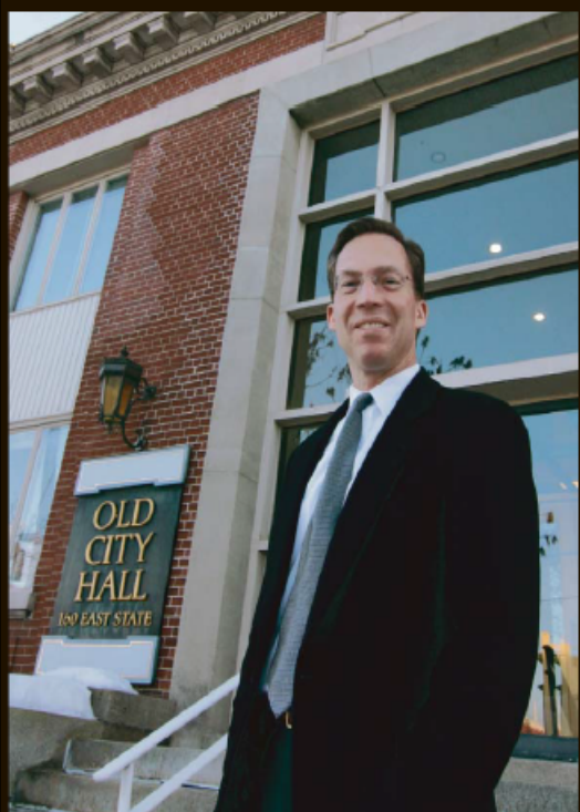
Downtown Traverse City